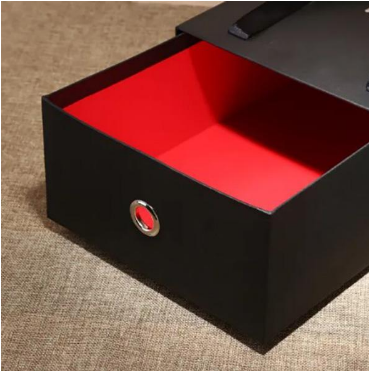
Sinst High Grade Leather Shoe Gift Box Process